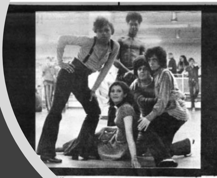
S.T.A.R. GAY, BISEXUAL & TRANSGENDER COMMUNITARIANS (S.T.A.R.) [From Come Out (No. 7, p. 5)] Photo by [unreadable]